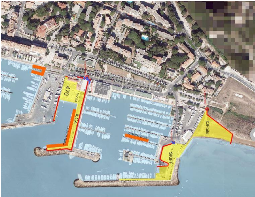
Location of the Base Nautique Municipale - Click here