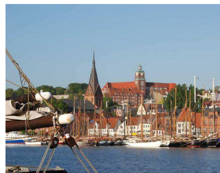
Tourismus- Information Glücksburg