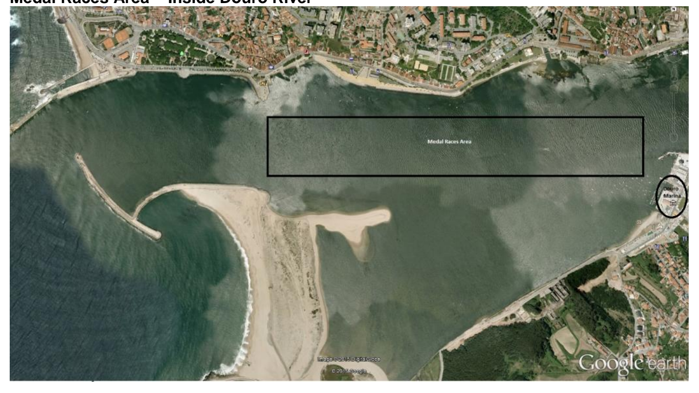
The images showed don't represent the real size of racing areas.