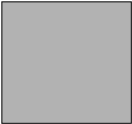
Pantone 428 C / EC